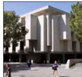
John F. Kennedy Library North

In addition to enjoying a creative learning environment, English Language Program students have free access to the Kennedy Library, Writing Center, University Student Union, conversation clubs, computer labs, campus email accounts, wi-fi access, gym workout facilities, basketball and tennis courts, and two heated swimming pools.