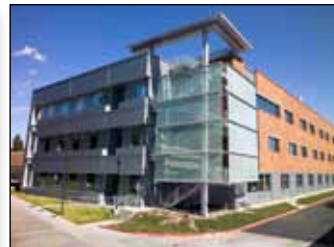
La Kretz Hall - Annenberg Integrated Sciences Complex